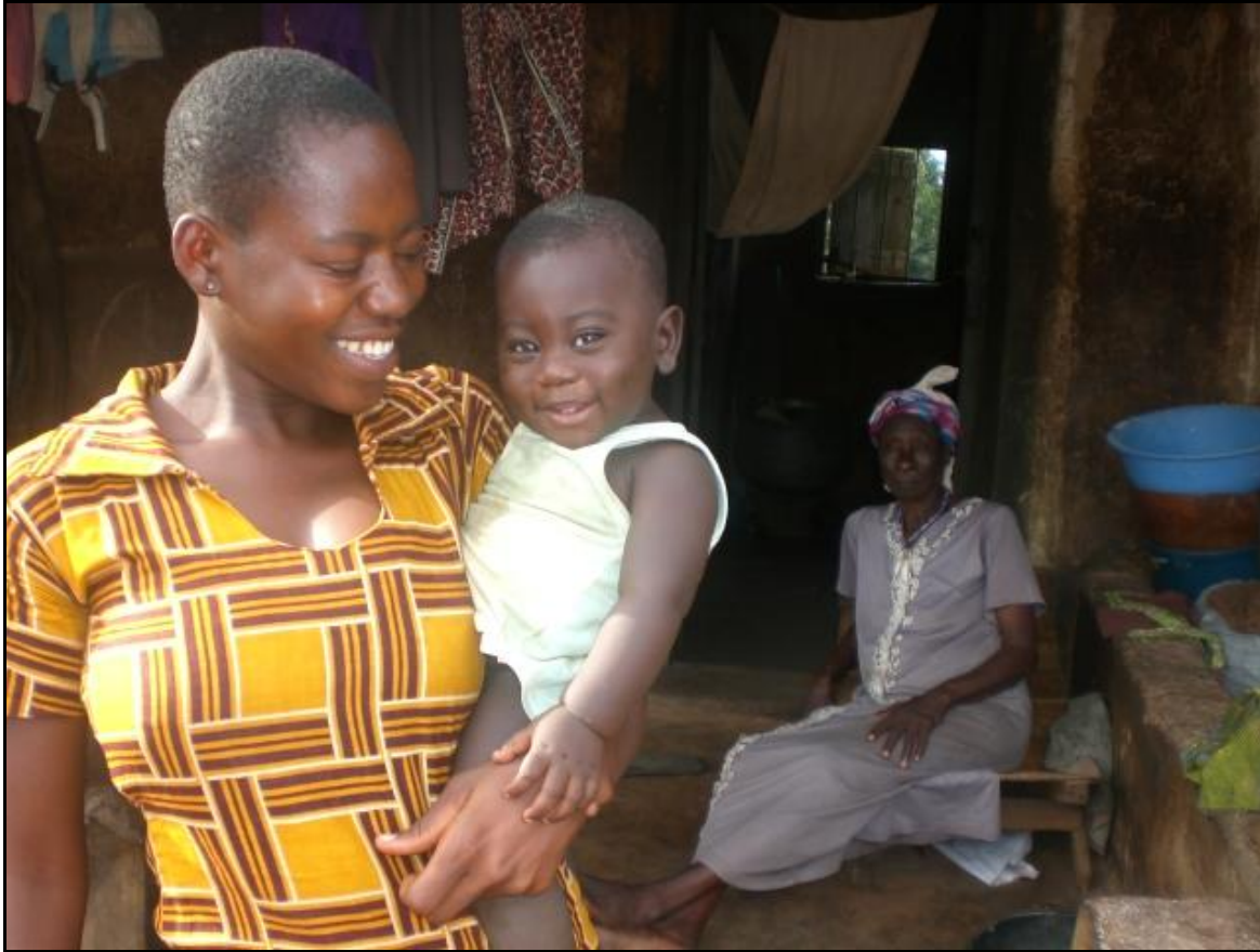
A qualitative project interviewing women in northern Ghana about their use of contraceptives. Sponsored by the Bixby Center for Population, Health, and Sustainability at UC Berkeley.