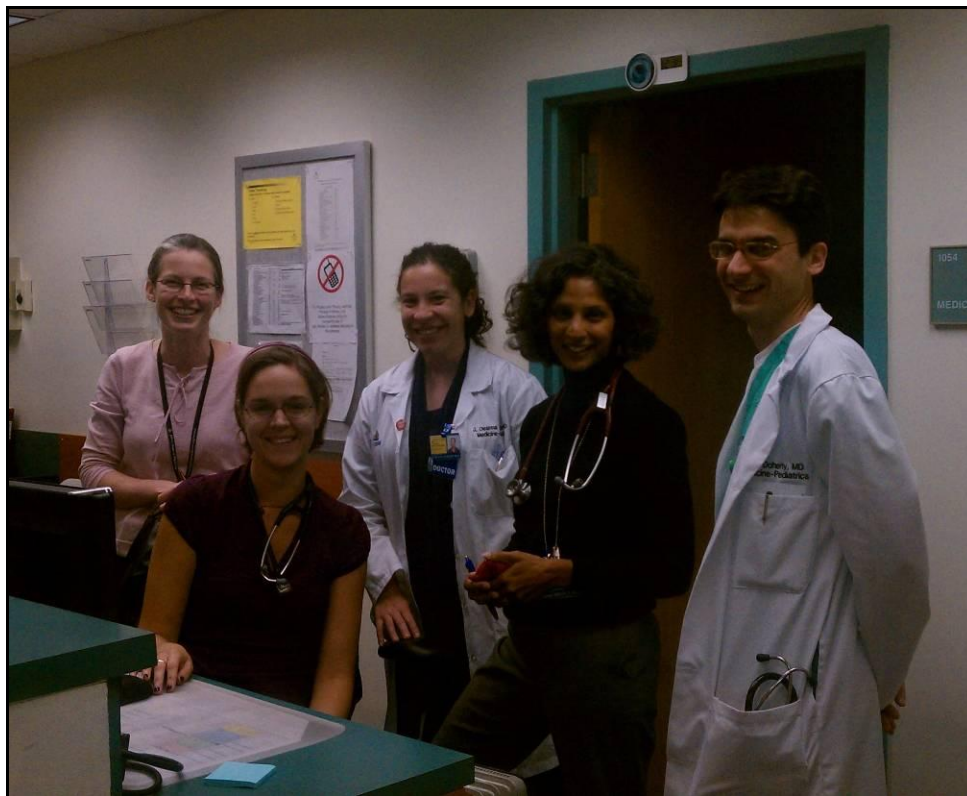
Members of the faculty, residency and NP training program at the East Baltimore Medical Clinic, part of the Johns Hopkins Urban Health Residency Program.

Ideally, a program or curriculum in global health should include education about health and development issues in developing countries as well as a mentored international experience. Finding the time and resources within a residency program is challenging. Below are some suggestions that may be useful, along with obstacles that may be anticipated.