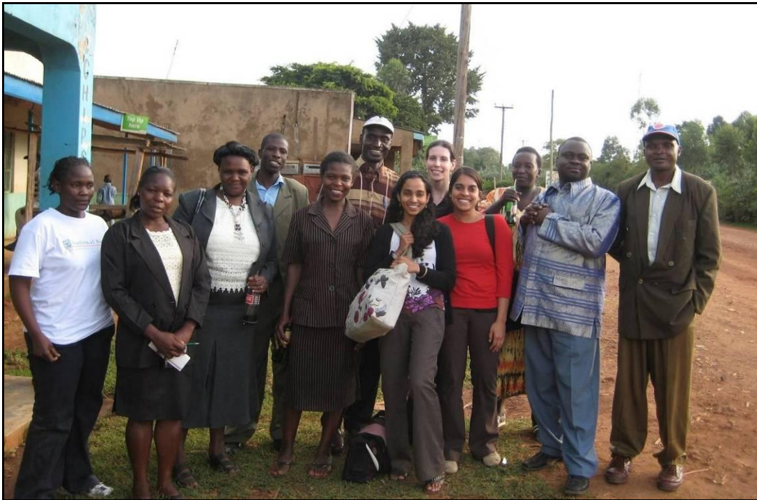
University of Pennsylvania global health track residents working with community health workers in Shibuye, Kenya.