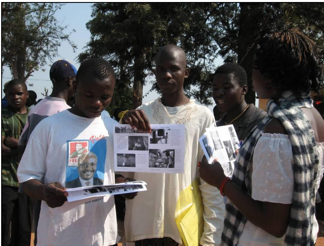
Mozambican students distribute newsletters on healthy living in their community.

Skills program in Ethiopia attracts surgeons and surgical assistants from Kenya and Sudan (www.cnis.ca).