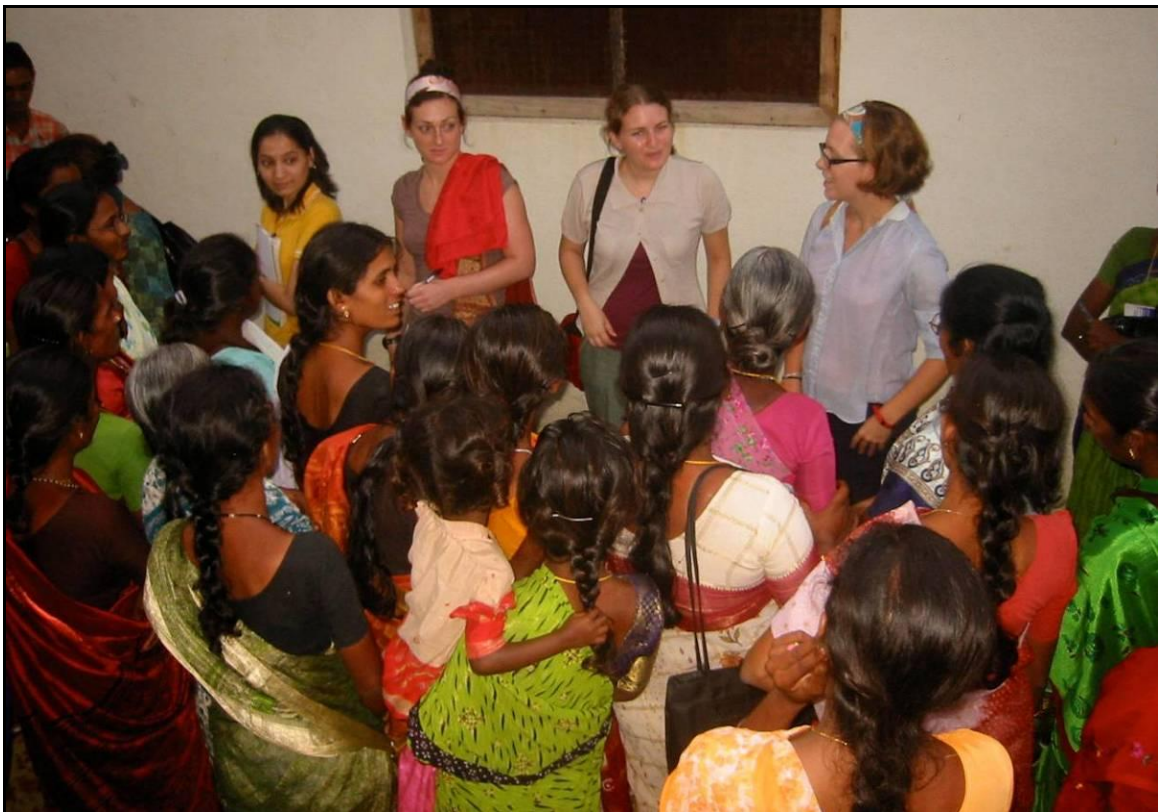
A conversation between students from the Medical School for International Health in Beer Sheva, Israel and students at the Comprehensive Rural Health Project in Jamkhed, Maharashtra, India.

Mentorship is an essential part of all resident training and is no less important for those interested in global health. Residency programs can facilitate mentoring relationships by identifying and supporting faculty members who participate in global health work or have substantial experience in developing countries. A global health mentor for a particular resident can come from a variety of backgrounds and does not necessarily need to be limited to one department (medicine or pediatrics, for examples), as residents can benefit from cross-disciplinary interactions and can thus determine the best fit for their mentor, based on topics or locations of mutual interest. Valuable mentors can also be found in resource-scarce countries that residents visit during international electives. Mentorship agreements should be in writing and meeting times set to review progress. 5