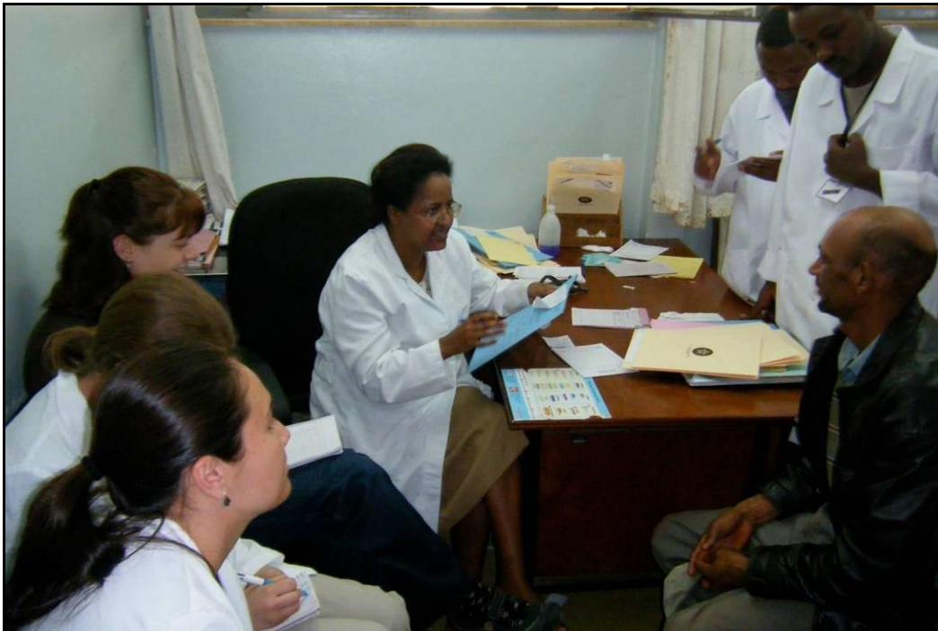
Fourth year medical students from the Medical School for International Health in Beer Sheva, Israel visit a Dermatology clinic in Addis Ababa, Ethiopia as part of a 7 week international medicine clerkship.

continue to do at home. If you would be willing to discuss your experience with future residents, it may be helpful to notify a program coordinator or residency director and give contact information. Alternatively, writing a short summary of your impressions of the site and valuable information you wish you had known prior to your rotation is extremely helpful for future students and residents. Whether or not you return to a particular site or pursue international work in the future, the impact of your global health rotation can endure well beyond the experience itself.