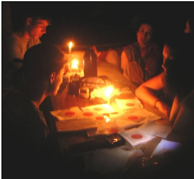
High school student volunteers with the NGO Bridges to Community review gram stains of community water source testing by candlelight in the North Atlantic Autonomous Region of Nicaragua.