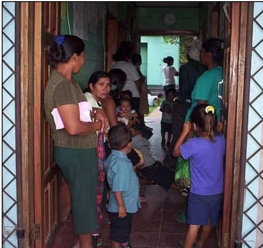
The clinic doorway in Coperna, RAAN, Nicaragua during a Tufts University School of Medicine collaborative clinic with the Nicaraguan National Health Ministry (MINSA) and international NGO Bridges to Community.

Mentorship teaching should be part of continuous faculty development, helping established faculty members to improve skills in mentorship. Institutions should establish protected time for discussion between faculty involved in global health work, and guidelines for management of the risks, benefits, ethics and preparation required for clinical work, both in local and distant communities. Faculty mentors should be recognized for participation in such a forum for discussion as part of their faculty development.